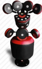
Optional Kick Pad