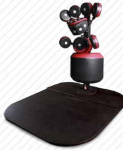
BoxMaster® Tower w/ Base