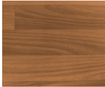
CS204 CINNAMON STICK